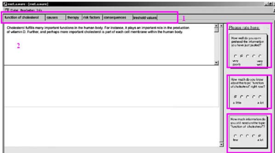
Fig. 2. Dashboard of the met.a.ware tool

sess and monitor their knowledge acquisition and comprehension via 3 meta-cognitive prompts: assess how well you have comprehended information they pasted (area 3), assess how much you currently know about the specific aspect of cholesterol (area 4), assess how much information you still need to search for regarding this theme (area 5). All ratings were attached permanently to the specific contents and could be retrieved and evolved at all times during future Internet research.