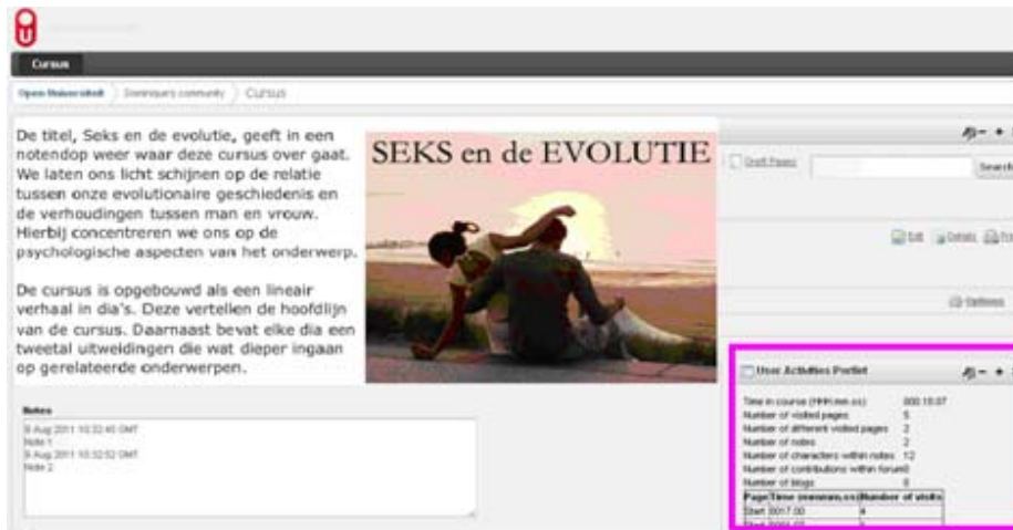
Fig. 3. The experimental course will revolve around a content AND a learning dashboard

The learning dashboard, developed on the eLearning platform Liferay, will mirror basic and easily accessible analytics (time spent on the course or on specific pages, number of page views, number of messages posted in the forum, number of annotations taken) related to clear-cut learning task.